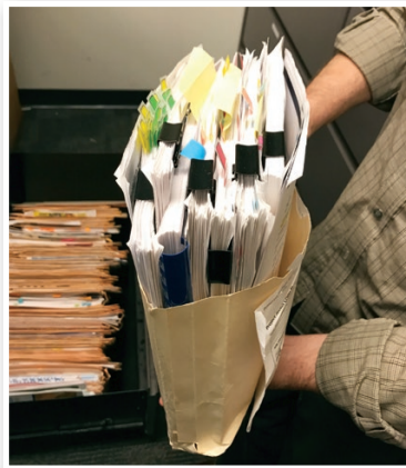
Legacy case management system

The company's Creative Services Team provides all marketing and regulated materials for external and internal use, which adds up to a repertoire of more than 60 media types in 30 different languages. The work of the Creative Services Team was 90 percent paper-based, with documents gathered in physical case folders containing mostly written information. This system of case management was both time consuming and inefficient. Workflows were handled manually and case files moved physically between different groups, often creating bottlenecks. Proofs and deliverables had to be printed then added to the case file.