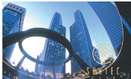
Asia-Pacific Headquarters, Singapore

The ISIS Papyrus Group is a unique expert-player in its own market niche. More than 250 employees leverage a tradition of excellence in meeting customer requirements based on a unique insight into customer-to-employee, employee-to-content and content-to-process relationships. The group is privately owned, profitable above industry average, has substantial cash reserves, and typically grows 10 percent per year.