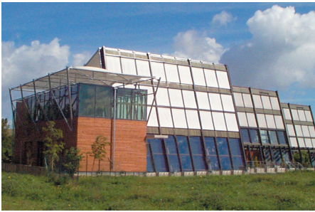
Corporate Headquarters, Vienna, Austria