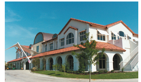
US Headquarters, Dallas, Texas

Starting from mainframe forms design in 1988, via the industry's most powerful, cross-platform and cross-industry document formatting tool, ISIS Papyrus offers since 2000 the unique, content- and process-driven Papyrus Business Information Platform .