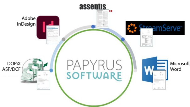
Automated Migration to Papyrus

We rely on our tried and tested best practices migration approach, which ranges from the initial analysis of existing documents and forms up to the full integration into the Papyrus CCM platform and adaptation to individual customer requirements. Documents and forms are evaluated for usage, output channels, ownership, and complexity, and detailed document profiles as well as a migration plan created.